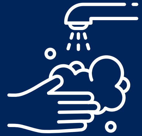
WASH YOUR HANDS FREQUENTLY OR USE HAND SANITIZER